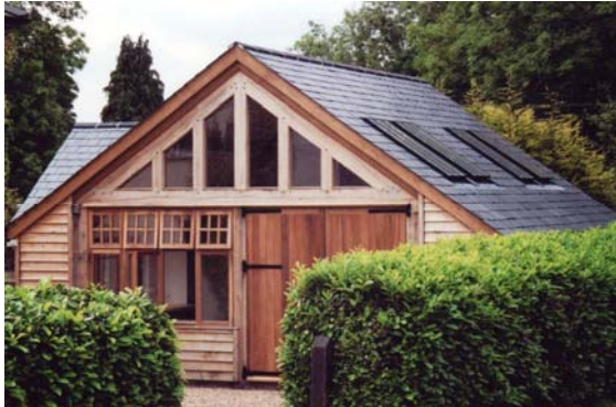
Elegantly simple exterior