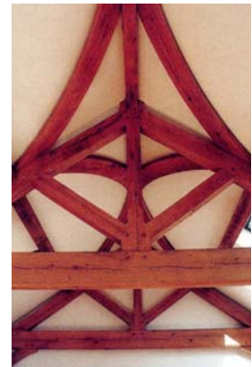
Exquisite detailing in the roof timbers